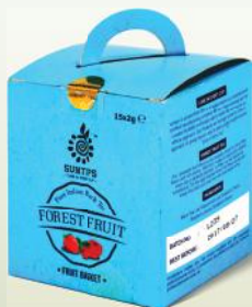
Forest Fruit: FB/01 15 crystal bags