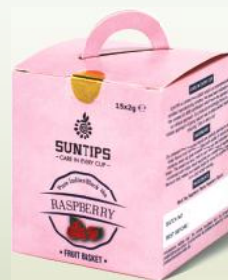
Raspberry: FB/04 15 crystal bags