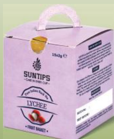
Lychee: FB/05 15 crystal bags