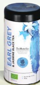
Earl Grey Jasmine: OT/05