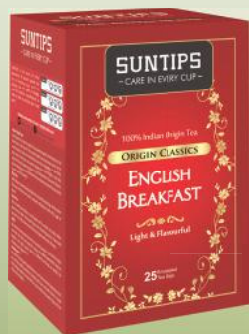
English Breakfast: BT/01