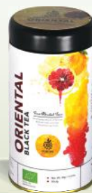
Oriental Black tea: OT/04