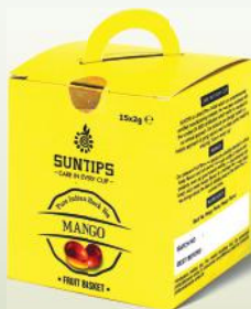
Mango: FB/02 15 crystal bags