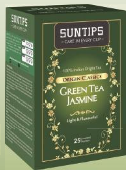
Green tea Jasmine: GT/02