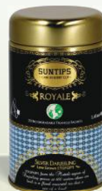
Gold Darjeeling: BD40/02