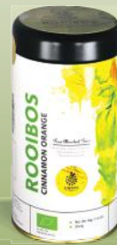
Rooibos cinnamon orange: OT/09