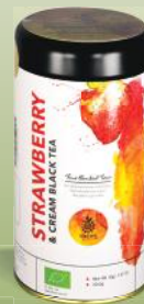
Strawberry Cream: OT/10