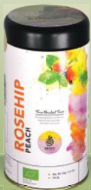
Rosehip Peach: OT/06