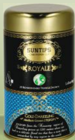
Silver Darjeeling: BD40/03