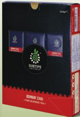
Bombay Chai: MB/02