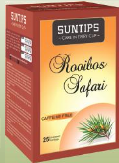
Rooibos Safari: FH/03