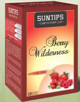
Berry Wilderness: FH/05