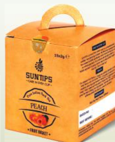
Peach: FB/03 15 crystal bags