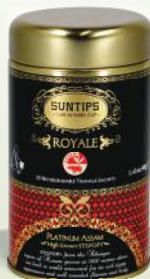
Platinum Assam: BD40/04