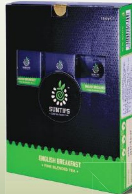
English Breakfast: MB/03