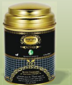
Silver Darjeeling: LT100/03