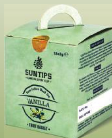
Vanilla: FB/07 15 crystal bags