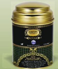
Silver Nilgiri Earl Grey: LT100/07