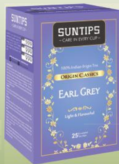
Black tea Earl Grey: BT/05