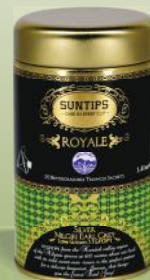
Silver Nilgiri Earl Grey: BD40/07