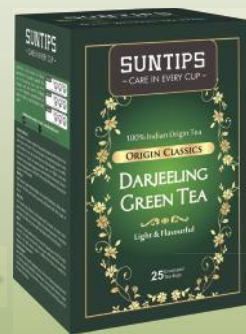
Darjeeling Green tea: GT/01