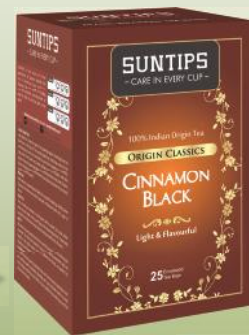
Black tea cinnamon: BT/06