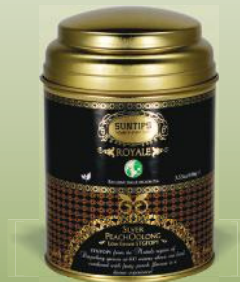
Silver Oolong Peach: LT100/08