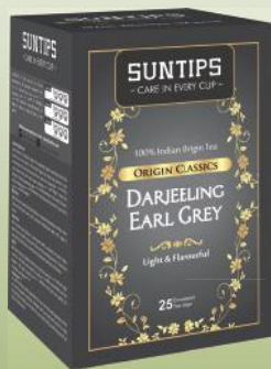
Darjeeling Earl Grey: BT/04