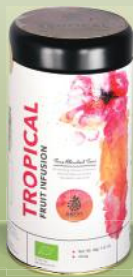
Tropical Fruit: OT/07