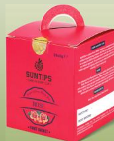
Rose: FB/08 15 crystal bags