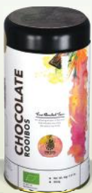
Chocolate Rooibos: OT/01