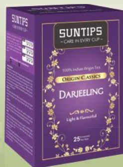
Darjeeling Black tea: BT/03