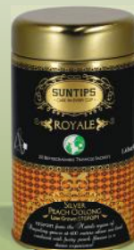
Silver Oolong Peach: BD40/08