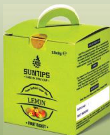
Lemon: FB/06 15 crystal bags