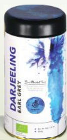
Darjeeling Earl Grey: OT/02