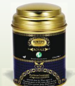
Platinum Darjeeling: LT100/01