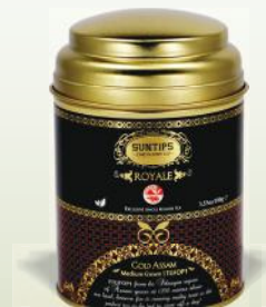
Gold Assam: LT100/05