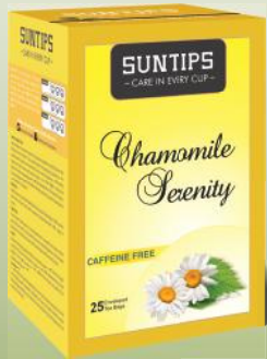
Chamomile Serenity: FH/01