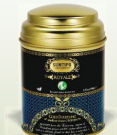
Gold Darjeeling: LT100/02