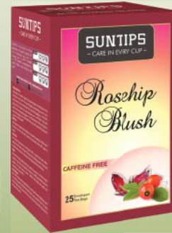
Rosehip Blush: FH/04