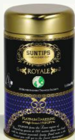
Platinum Darjeeling: BD40/01