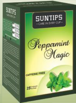
Peppermint magic: FH/02