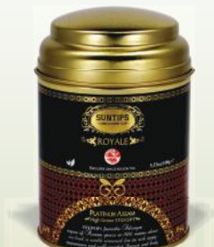
Platinum Assam: LT100/04