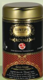
Silver Assam: BD40/06