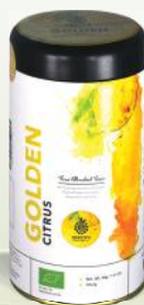
Golden Citrus: OT/03