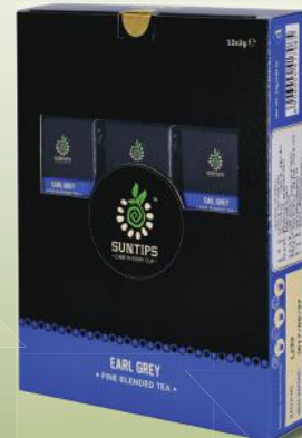
Earl Grey: MB/01