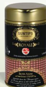
Gold Assam: BD40/05