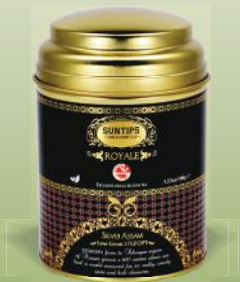
Silver Assam: LT100/06